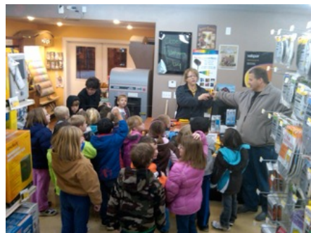
Kindergarten students enjoy a measuring trip to Hartford Building Center.